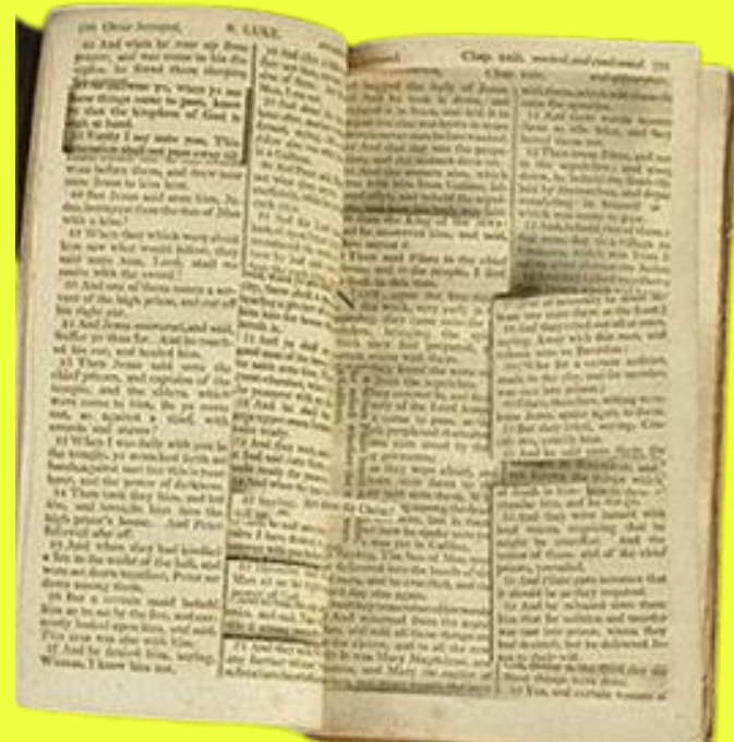
The Jefferson Bible